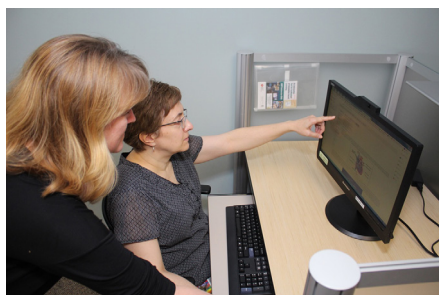
Interior Health Authority

e-HLbc promotes cross-sectoral collaboration between the post-secondary and health care sectors of British Columbia. Together, libraries bring down costs and maximize access to critical health information across the province.