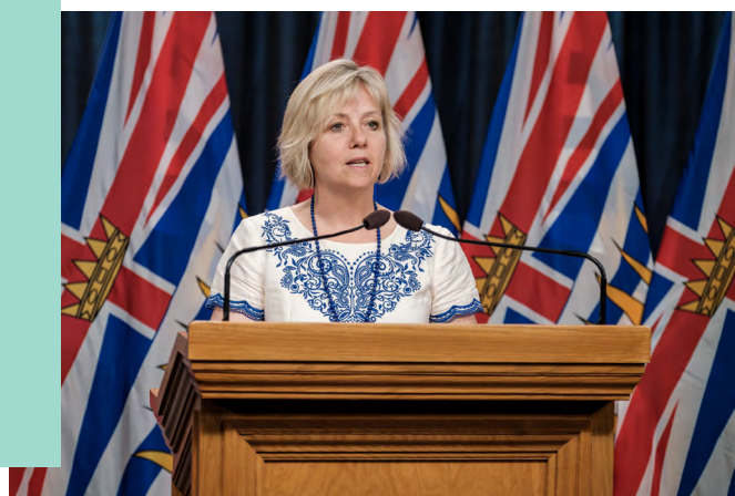
Dr. Bonnie Henry provides an update on COVID-19 in British Columbia, August 27, 2020.

In response to the COVID-19 pandemic, the eHLbc Administrative Centre advocated for lower annual increases on electronic resources to reduce financial pressures on eHLbc members. The consortium succeeded in either eliminating or reducing increases on five annual renewals, with a promise of three additional reductions in the coming year.